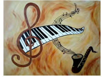
Darlene Dittoe "Notes of Jazz"