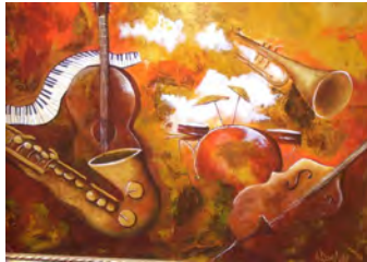
Doug Agee "Golden Sounds of Jazz"