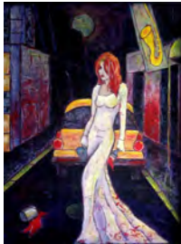
Tanya Slate "Painting the Town Red"